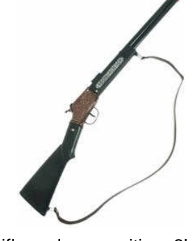
rifle and ammunition, 6kg